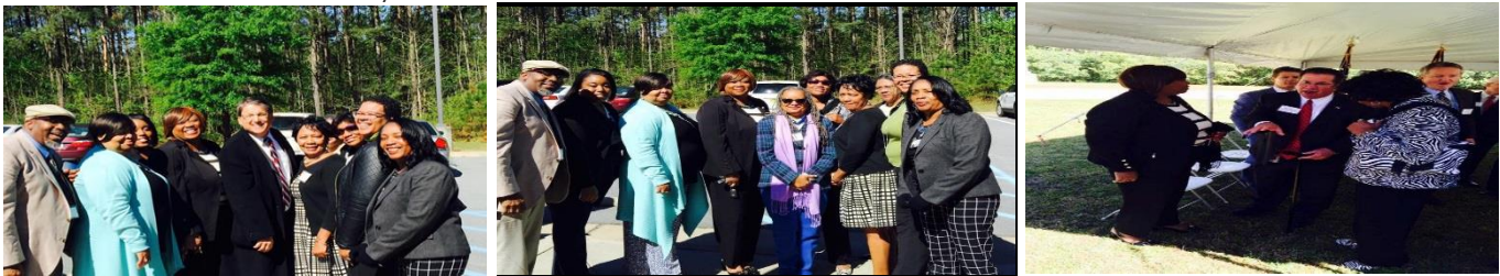
CSBG Staff with Governor Pat McCrory and Senator Angela Bryant

The renovation, updates and re-opening of this facility is an integral part of North Carolina's Juvenile Justice Facilities Strategic Plan. The new facility will increase the state's youth development center bed capacity in a safer, more secure facility, and at a lower cost.